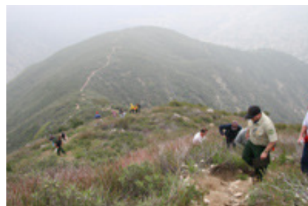
Staff ride participants hiking in the footsteps taken by the El Cariso Hot Shots in 1966.