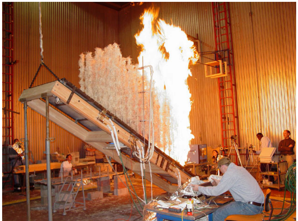
Researchers studying fire behavior at the Missoula Fire Sciences Laboratory, USDA Forest Service, Rocky Mountain Research Station.

Send us your photos for the newsletter! Include a caption describing who, what, where, and when..