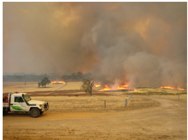
IAWF member Dan Jamieson sent this photo taken in January by crew members of the North East Victoria Task Force at the Mt. Lubra Fire in Grampians National Park, Victoria, Australia. Started by lightning, the fire burned 130,000Ha (321,000 acres). Note the spot fires, some of which were reported 2 kilometers in front of the fire.

The International Journal of Wildland Fire, the peer-reviewed scientific journal of the IAWF and the printed record of most wildland fire-related research, has been so successful that there is a problem--more papers than can be accommodated in four issues per year. Therefore, beginning in 2007, the Journal will increase the number of issues to six each year. More details will be posted on our web site.